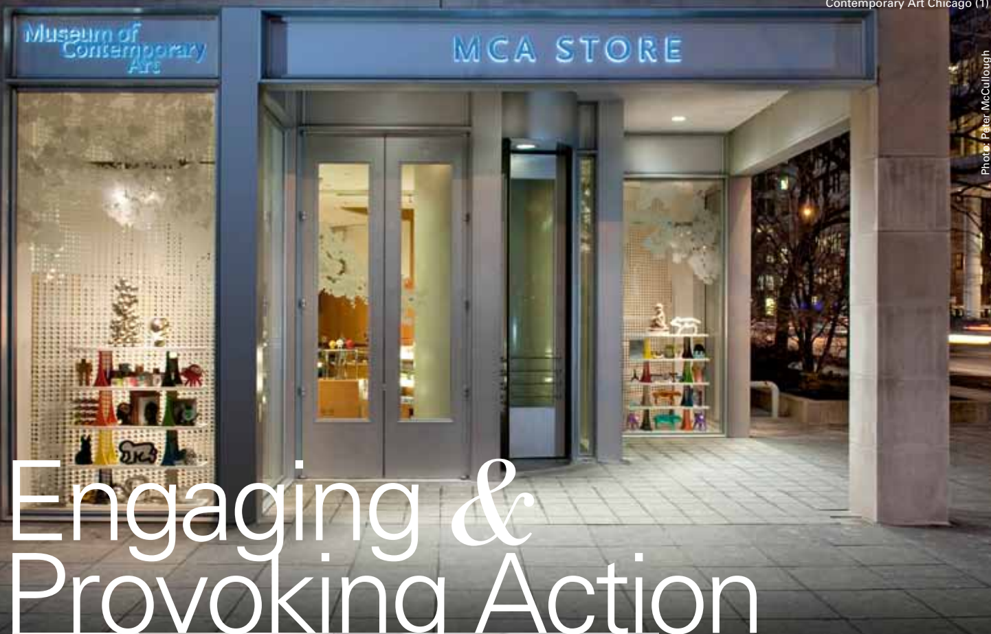
MCA Store exterior, Museum of Contemporary Art Chicago (1)